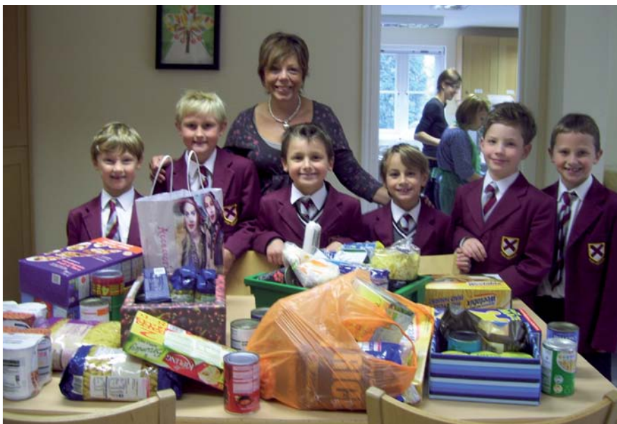
Students from Cranmore School with the goodies gathered for Cherry Trees following their harvest service

Local schools got active this summer, with Cranmore raising £3,156 from their annual sponsored swim in aid of Cherry Trees and Ripley Court held its 3rd sponsored walk raising £5,631, some of which will buy a new music system for our home. Cherry Trees was also the recipient of lots of goodies following the harvest service at Cranmore in October. Parkside School held a 'Raise a Smile' concert at the end of the summer term and elected to send the proceeds, totalling over £1,300, to us. As well as helping to organise and provide financial support for our community arts project, George Abbot School kindly donated £500 following the Year 7 Charity Fundraising Week earlier in the year. We are extremely grateful to all the schools that continue to offer us such invaluable support.