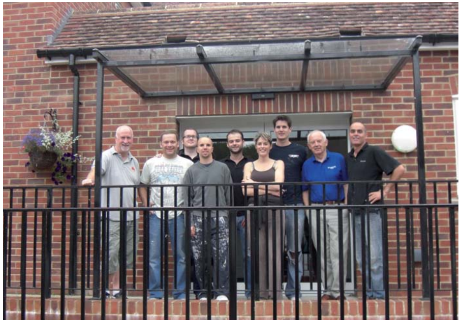
The team from Lexus Guildford after helping us with a day's decorating

Sainsburys believes in making a positive difference to the communities it serves and, following nominations from their customers, Cherry Trees was delighted to be chosen by the Burpham branch as their Charity of the Year 2010/11. Their support means a lot to us. After a vote between 6 different local charities, Lexus Guildford chose to donate a day's hands on help to Cherry Trees so on Tuesday 14th September a team of 9 staff came ready for a day of redecoration; this was to include a kitchen and children's bedroom and a lot was achieved in a short amount of time! Everyone agreed it was a great day out and what a fantastic way to give something back to the community.