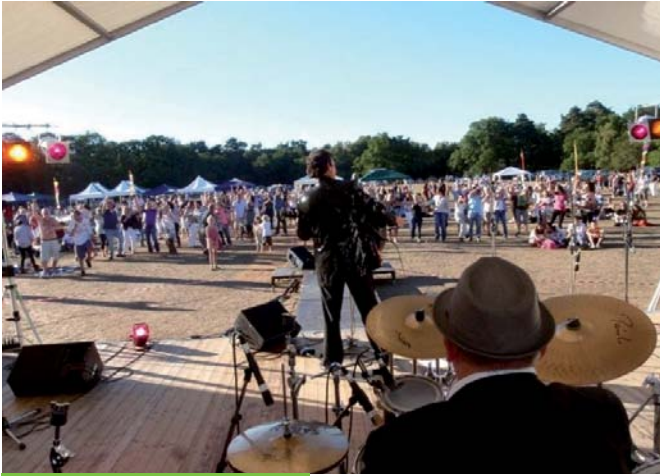
A great crowd at the 2nd Albany Free Festival in July