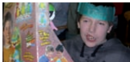
Children were surprised by a visit from Father Christmas at the Christmas party which took place at St. Teresa's School.