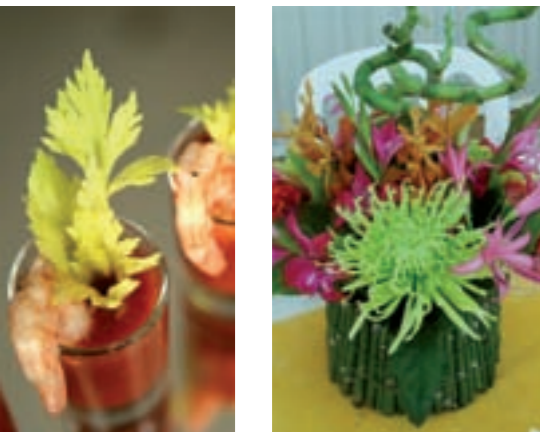
Examples of the food and flowers demonstrated by Two Many Cooks and Kim Shaw just before Easter.