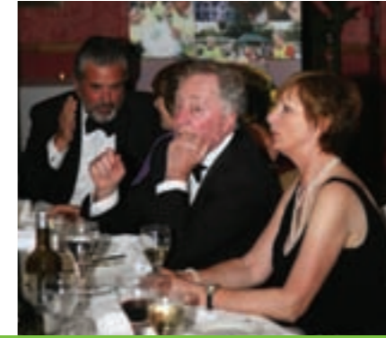
Above: The Guildford Lions Charity Ball was a huge success Below: Attendees of the Cherry Trees Corporate Challenge launch pose for photos.